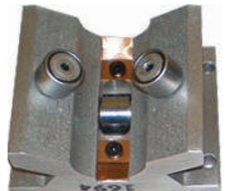
Beryllium Copper Scrapers clear debris from the top, load carrying rollers.

Rollers roll over debris, balls include it!