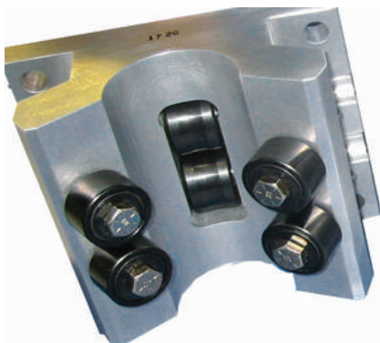
LM76 JET Rail Roller Block

The end caps with scrapers were pryed away from the block due to debris building-up under the block.