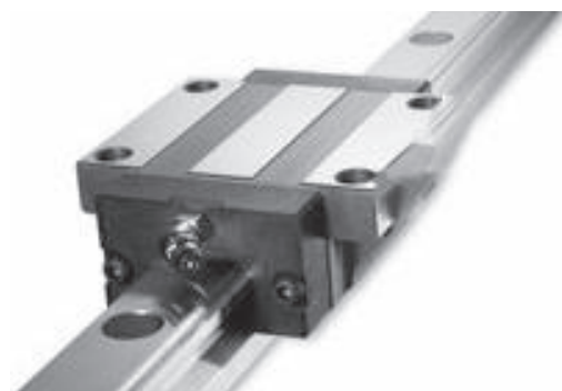
Profile Rail Guide